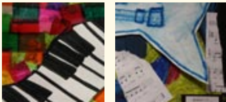
Sample art work

The performing arts center invites Central Florida students to create an artistic perspective of their own performing arts experiences to adorn the fence. The goal is to transform a blank chain link fence into a brilliant, colorful display of our community's youthful arts and cultural interpretations, based on the theme, "Celebrating Each Other through the Performing Arts."