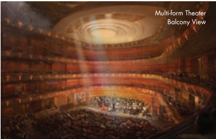
Multi-form Theater Balcony View