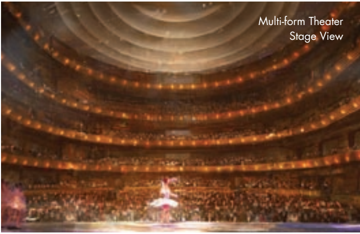
Multi-form Theater Stage View