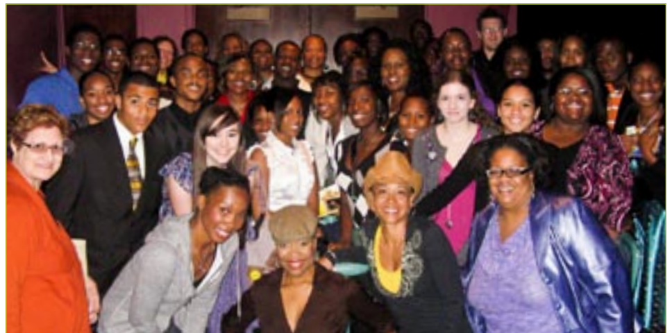
An evening at the theater.

In November, the performing arts center hosted an evening at the theater. Aligned with the project's commitment to the Central Florida community and mission of creating a premier center for arts education, Hines, as well as community partners Balfour Beatty Construction, Orlando Magic Youth Foundation, Tupperware Brands Foundation and Universal Orlando Foundation, sponsored over 40 high school students, teachers and parents to attend the touring show of the acclaimed musical The Color Purple at the Bob Carr Performing Arts Centre. The students from the Parramore Kidz Zone program, Dr. Phillips High School, Edgewater High School, Ocoee High